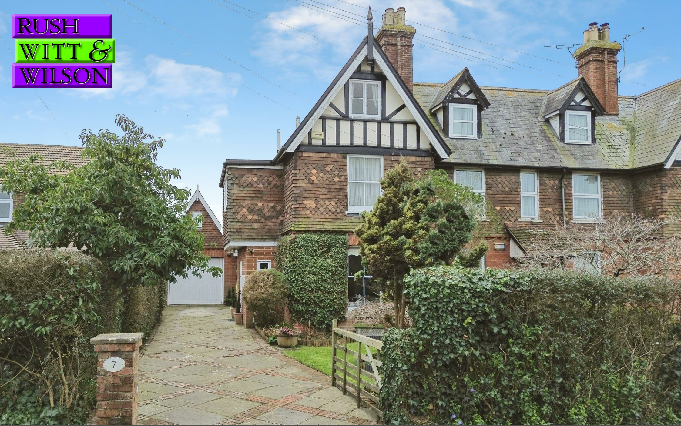
7 Marden Road, Staplehurst, Kent, TN12 0NF. £575,000 OIEO Freehold